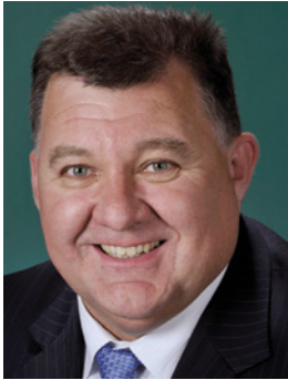
KELLY, Craig Member for Hughes (NSW) Liberal Party of Australia