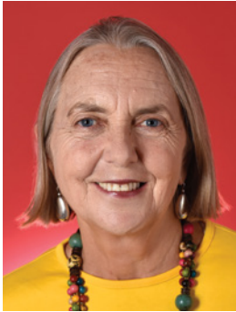
RHIANNON, Lee Senator for New South Wales Australian Greens