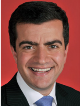
DASTYARI, Sam Senator for New South Wales Australian Labor Party