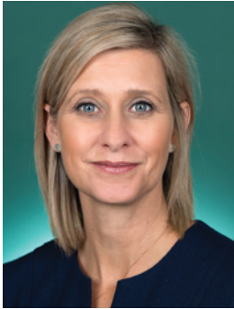
LAMB, Susan Member for Longman (Qld) Australian Labor Party