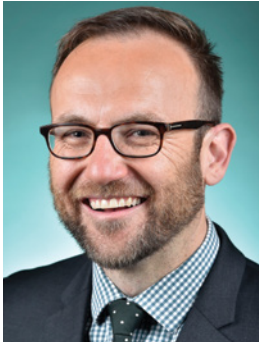
BANDT, Adam Paul Member for Melbourne (Vic.) Australian Greens