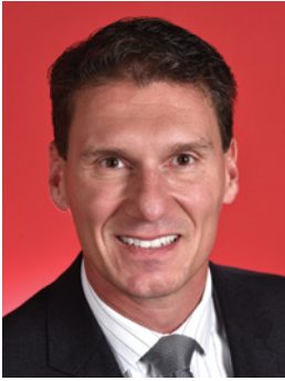
BERNARDI, Cory Senator for South Australia Independent