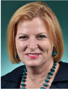
OWENS, Julie Ann Member for Parramatta (NSW) Australian Labor Party