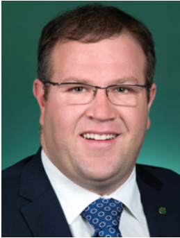
MORTON, Ben Member for Tangney (WA) Liberal Party of Australia