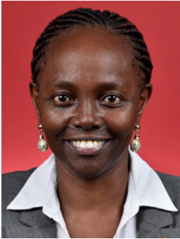
GICHUHI, Lucy Senator for South Australia Independent