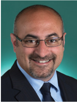
KHALIL, Peter Member for Wills (Vic.) Australian Labor Party