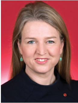
PRATT, Louise Clare Senator for Western Australia Australian Labor Party